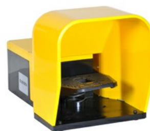
One pedal, with free actuation - with cover KG200